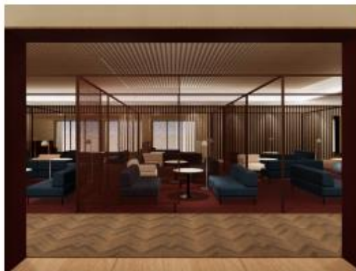
Internal view of Sergeant's lounge area