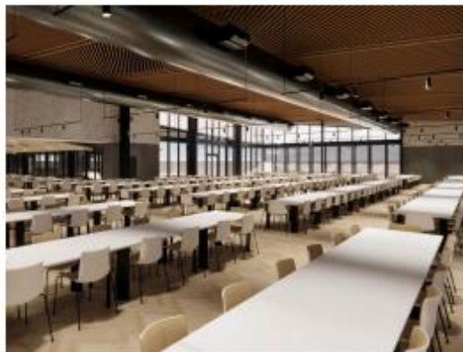
Internal view of Other Ranks dining area