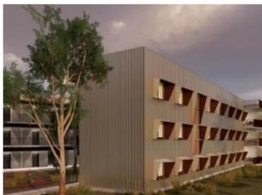
External view of living-in accommodation