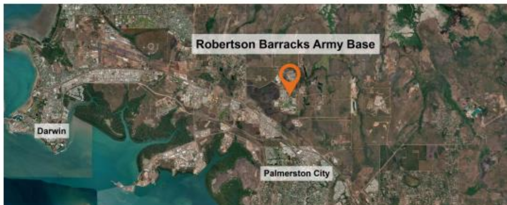
Location of Robertson Barracks

The Robertson Barracks Base Improvements Project aims to provide essential upgrades to facilities and infrastructure to support the Australian Defence Force and allied partners. When completed, the Project will provide Robertson Barracks with new living-in accommodation, increased messing capacity, as well as upgraded water and electrical infrastructure.