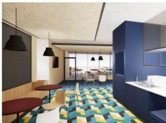
Internal view of common room