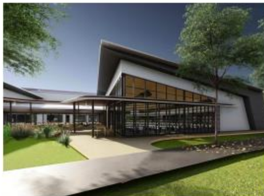
External view of messing facility