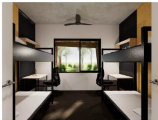
Internal view of bedroom