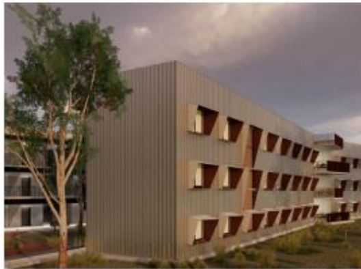
External view of living-in accommodation