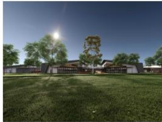
External view of mess facility