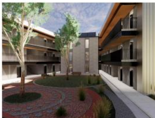
External view of courtyard