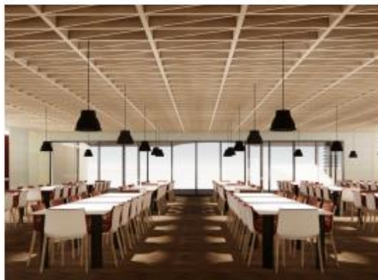
Internal view of Sergeants dining area